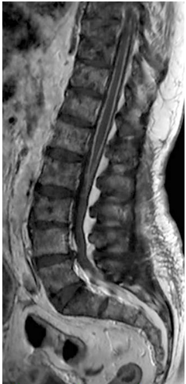
Fig 2. — Leptomeningeal perimedullary enhancement on sagittal T1-weighted, gadolinium-enhanced magnetic resonance imaging of the spinal column.

Normalizing CSF dynamics results in survival rates similar to that of patients initially without CSF flow interruption. 41